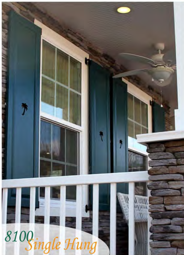
8100 Single Hung