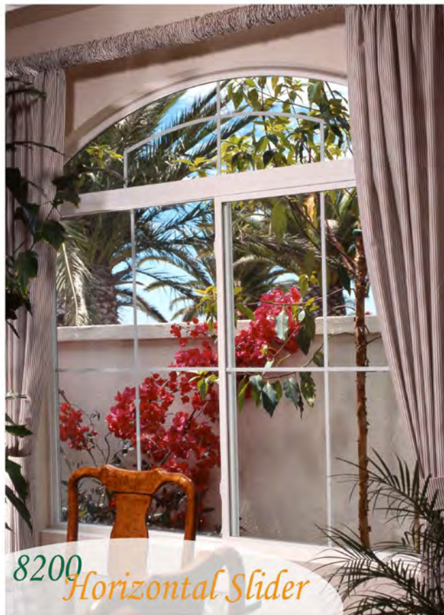
8200 Horizontal Slider