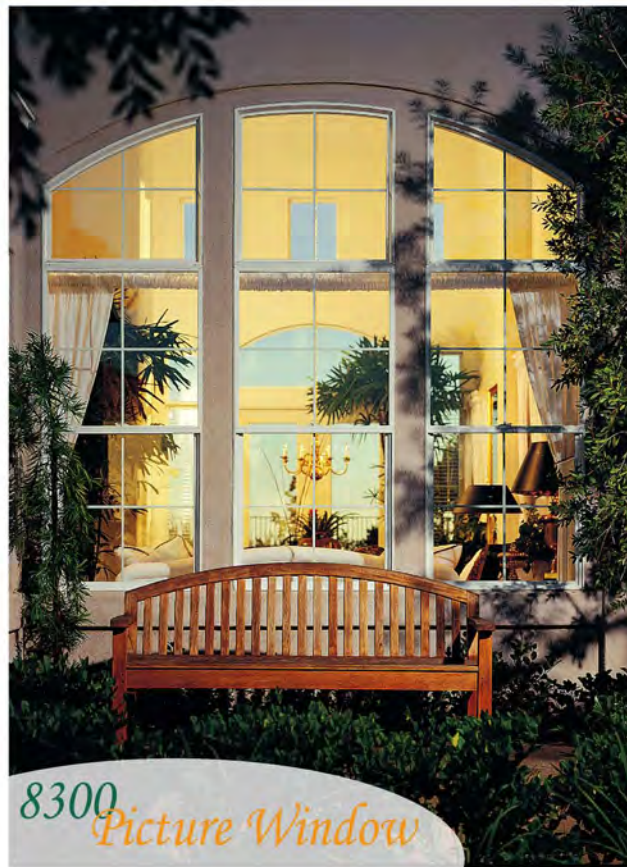
8300 Picture Window